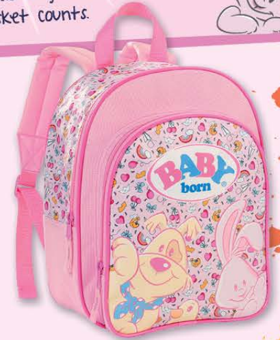
Size: approx. 30 cm high