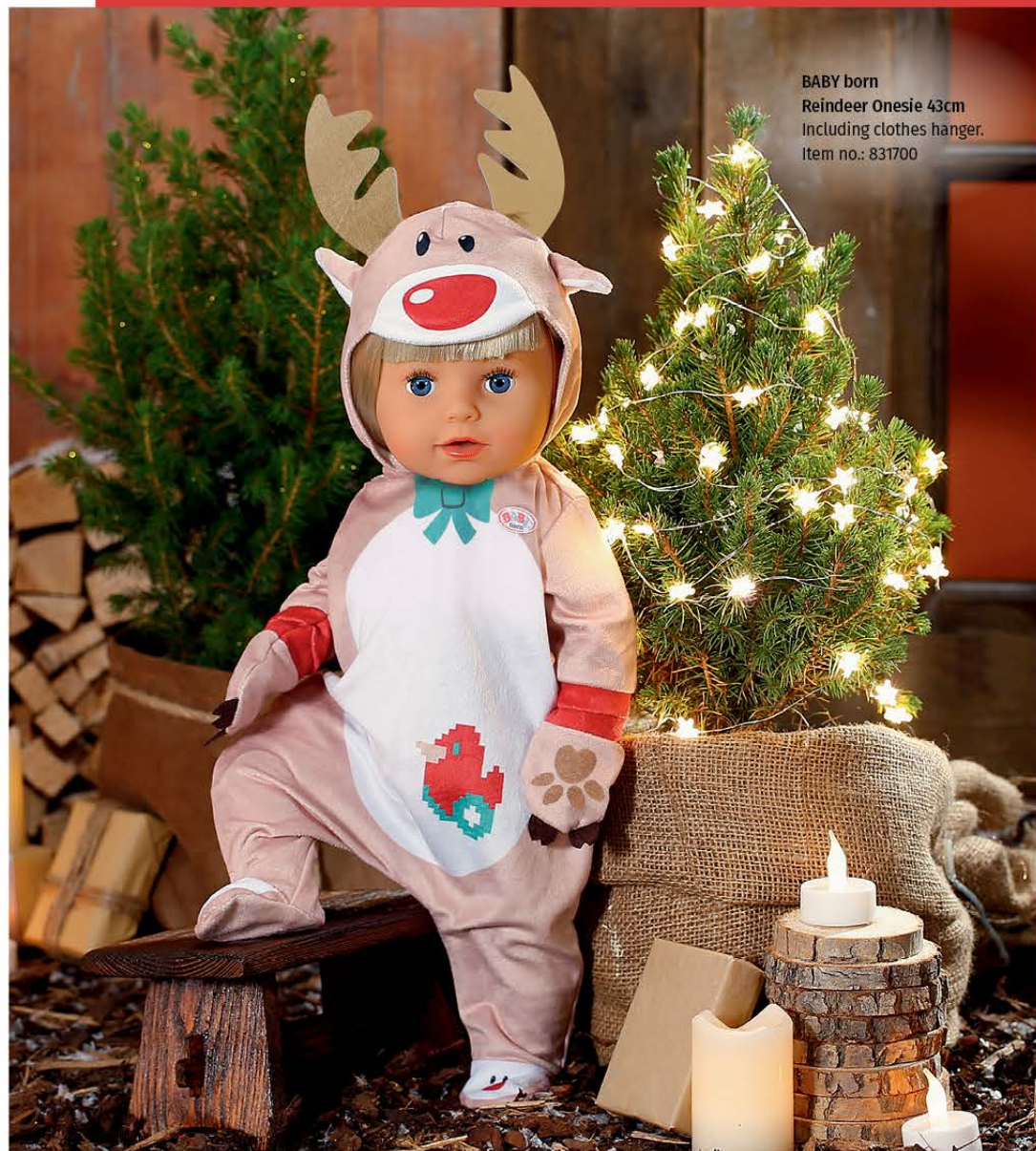
BABY born Reindeer Onesie 43cm Including clothes hanger. Item no.: 831700

He won't find any fashion mistakes anyway! BABY born and her siblings' consciences are as clean as the furry belly of the cuddly reindeer onesie is white. The plush overall features golden antlers, adorable deer ears and a funny stub tail. The hoof-shaped gloves are directly attached to the onesie. And, of course, the obligatory red Rudolph nose also adorns the outfit.