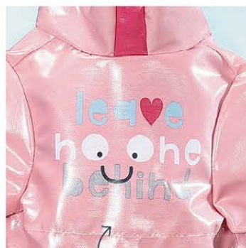
sweet print on back

BABY born's functional clothing protects her from windy and wet weather. And whenever she's out and about, she's always sporting new interpretations of pink: whether her raincoat in two shades of pink, which she combines with light blue waterproof trousers and turquoise wellies, or the fluffy pink coat decorated with badges, which looks great together with the leggings in shimmering metallic look. She is also wearing a glittery bobble hat in a lighter shade of pink.