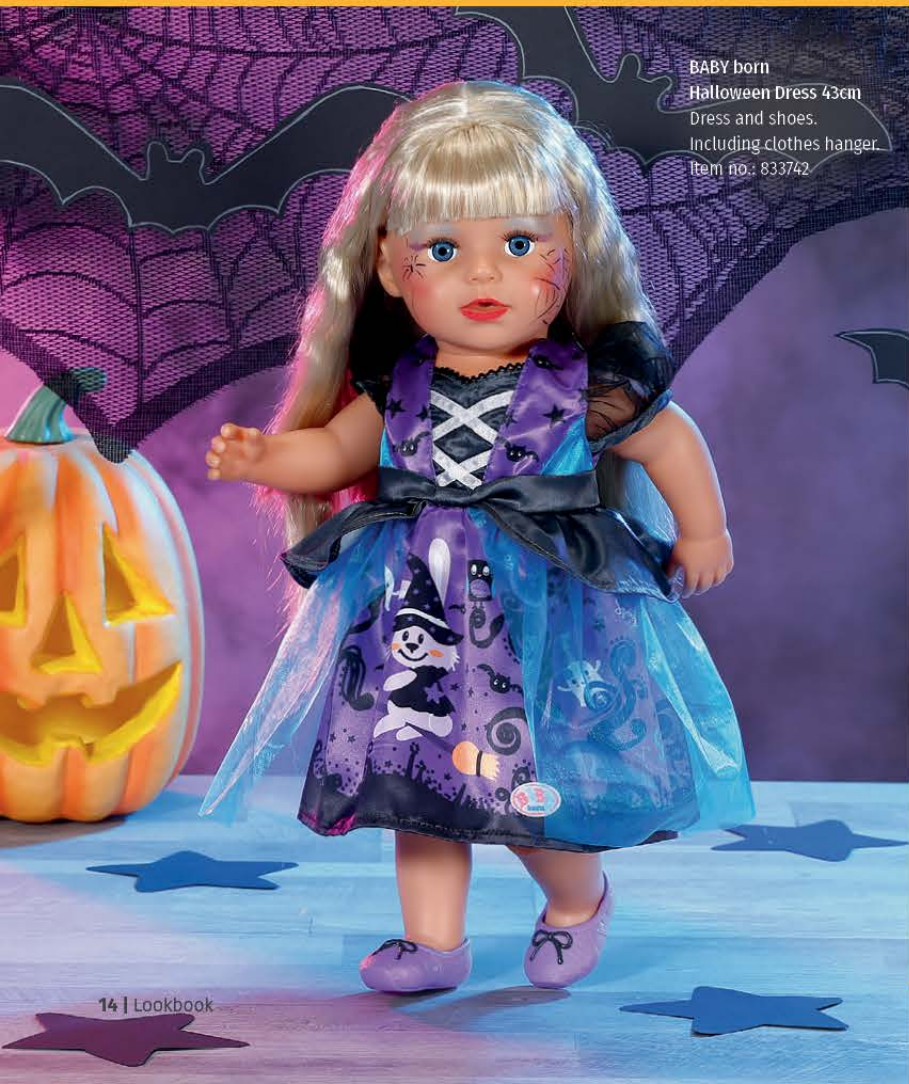
BABY born Halloween Dress 43cm Dress and shoes. Including clothes hanger. Item no.: 833742

"Wooooo!" It's the big night for fans of all things creepy and sweet collectors. All the little terrors love to dress up for Halloween, and BABY born is no exception. She's wearing a dress in the colours of the night. The purple gown has a cute print that is shrouded by a blue tulle layer. Black details such as the tulle sleeves, the corset lacing on the chest and the overskirt round off the spooky outfit.