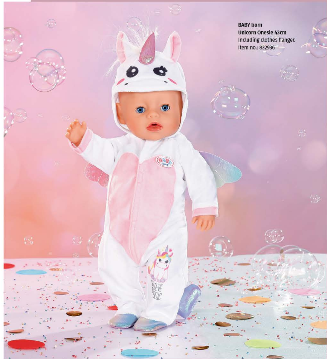
BABY born Unicorn Onesie 43cm Including clothes hanger. Item no.: 832936

BABY born simply loves dressing up, and this unicorn outfit is one of her very favourites. This cuddly unicorn onesie combines pure white with metallic rainbow features on the wings, feet and tail. But of course, the most important thing is the hood with its mane, its sweet little ears and unicorn's horn in rainbow colours. The pink heart on the front of the onesie shows BABY born's close bond with everyone who believes in magic, as does the unicorn print on the left leg.