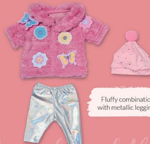
Fluffy combination with metallic leggings