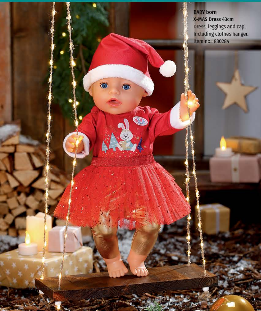
BABY born X-MAS Dress 43cm Dress, leggings and cap. Including clothes hanger. Item no.: 830284

Styling is a cause for celebration for BABY born! Her outfits for the Christmas period are a real cracker. The design of the red dress is inspired by the clothing of Santa's elves from the North Pole. On the shirt with white cuffs, Benno the bunny is hanging stars on the Christmas trees. The tiered tulle skirt is covered in fairy dust. The golden leggings underneath highlight the glitter particles even more.