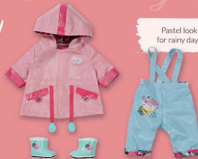
Pastel look for rainy days