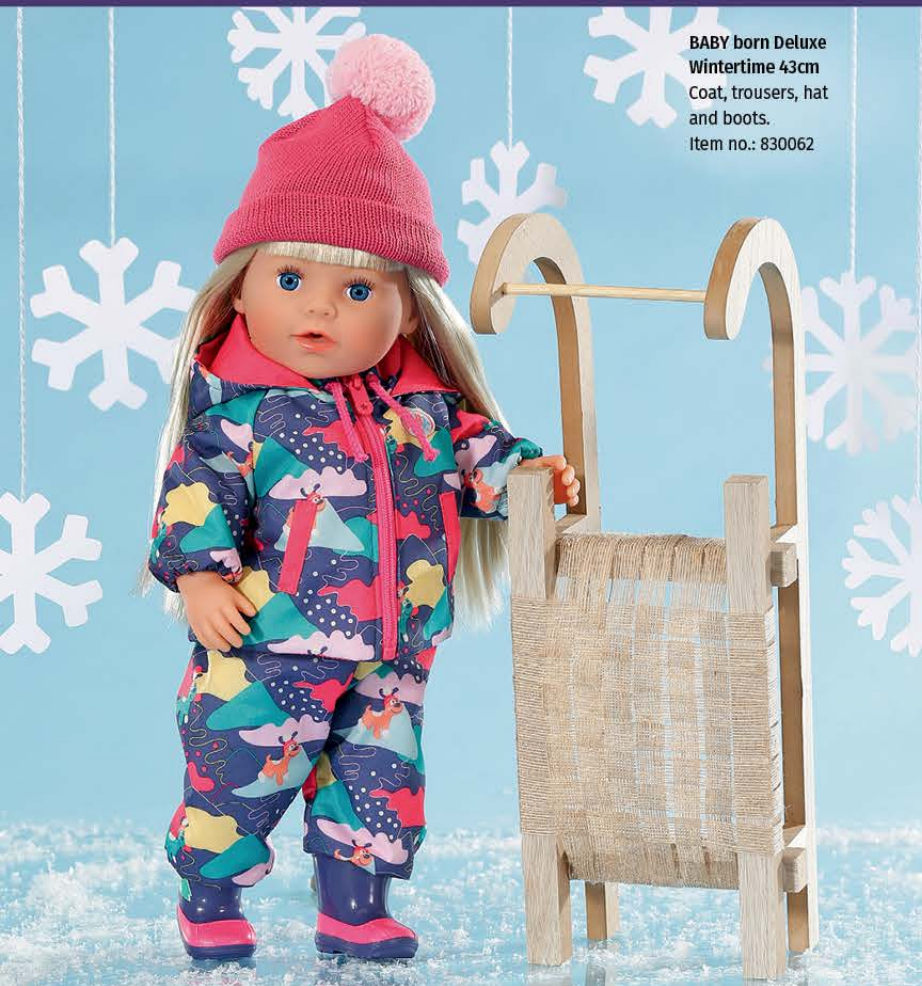
BABY born Deluxe Wintertime 43cm Coat, trousers, hat and boots. Item no.: 830062

It's time for BABY born to go sledging! To make sure she doesn't get too cold while she's enjoying the winter wonderland, she's wearing her new two-piece snow outfit. The coat and trousers feature the same colourful design with Bello the dog. And the colour of her winter wellies matches her outfit perfectly – just like her hat, which she definitely shouldn't forget while she's out playing in the snow.